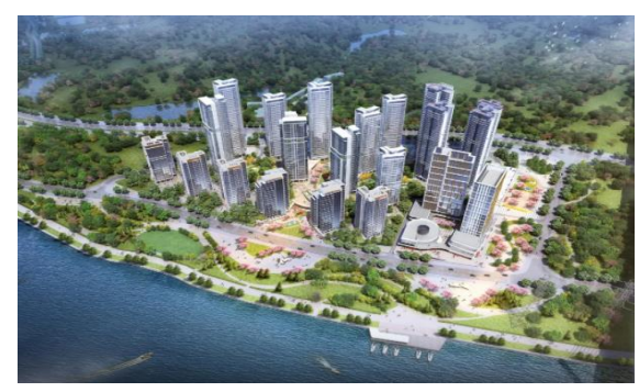
Guangzhou Aoyuan-Henderson The Residence Class (CGI)

Zhuhai Aoyuan The Residence Class is scheduled to open its sales centre in July this year and to be launched for sale in the third quarter of this year. With estimated saleable resources of approximately RMB20 billion, the project is currently one of the largest urban redevelopment projects in Zhuhai, it is to be developed into an international complex featuring tourism, commercial, cultural, entertainment and residential functions.