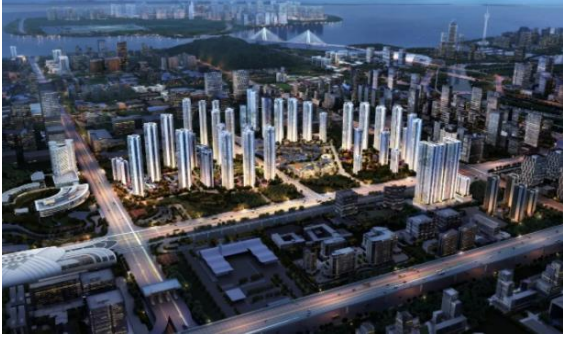
Zhuhai Aoyuan The Residence Class (CGI)