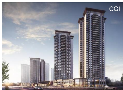
Guangzhou Aoyuan Yunhe Mansion

On 19 September, Aoyuan launched Aoyuan Academy No. 8, one of the building blocs of Guangzhou Aoyuan Yunhe Mansion under the Yunfeng Series, one of Aoyuan's three high-end product suites. The bloc recorded sales nearing RMB200 million. Located in Baiyun Smart City in Guangzhou, the projects is one of the few offering quality low-density housing in the district. Adjacent to Jiangfu Station where Metro Line 8 and Line 24 intersect, it enjoys comprehensive auxiliary facilities in proximity including Peiwen Elementary and Middle Schools of Peking University, as well as eight major commercial districts in Baiyun.