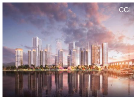
Guangzhou Aoyuan Henderson The Residence Class

On 18 September, Guangzhou Aoyuan Henderson The Residence Class was launched, attracting a keen response with sales exceeding RMB1 billion in just two hours. Guangzhou Aoyuan Henderson The Residence Class belongs to one of Aoyuan's three high-end product suites. Its overall design is jointly undertaken by three internationally-respected studios. The project is surrounded by premier auxiliary facilities including renowned educational institutions, providing residents with a quality cultural lifestyle.