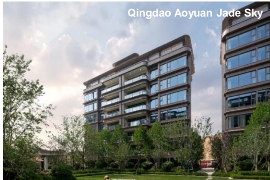
Qingdao Aoyuan Jade Sky

In the first 11 months in 2021, Aoyuan delivered over 70 projects in China, representing an increase of approximately 30% year-on-year. Total gross floor area delivered was over 5 million sq.m., representing an increase of 45% year-on-year.