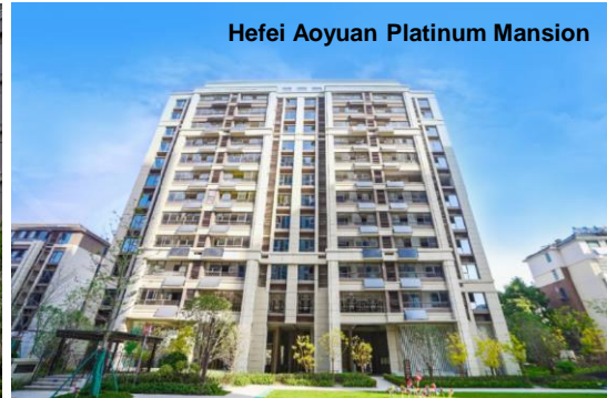
Hefei Aoyuan Platinum Mansion