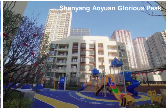
Shenyang Aoyuan Glorious Peak