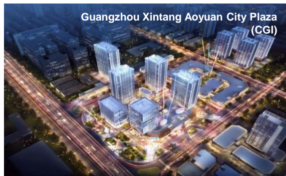
Guangzhou Xintang Aoyuan City Plaza (CGI)