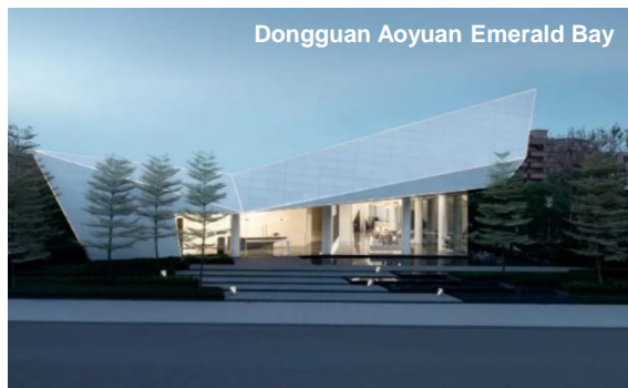
Dongguan Aoyuan Emerald Bay