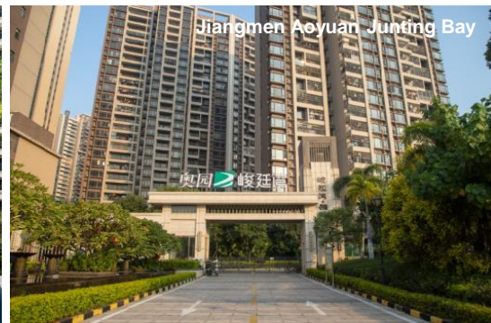
Jiangmen Aoyuan Junting Bay