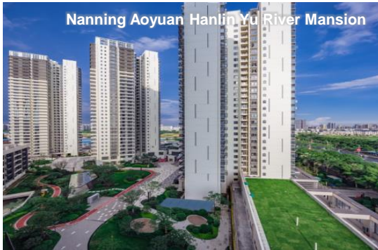
Nanning Aoyuan Hanlin Yu River Mansion