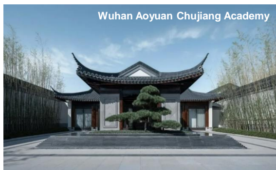
Wuhan Aoyuan Chujiang Academy