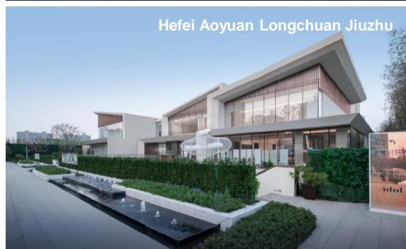
Hefei Aoyuan Longchuan Jiuzhu