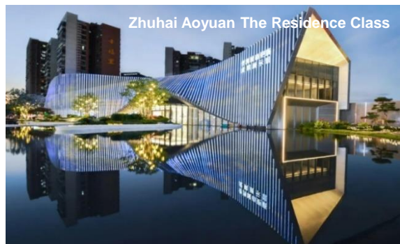
Zhuhai Aoyuan The Residence Class