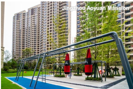
Jingzhou Aoyuan Mansion