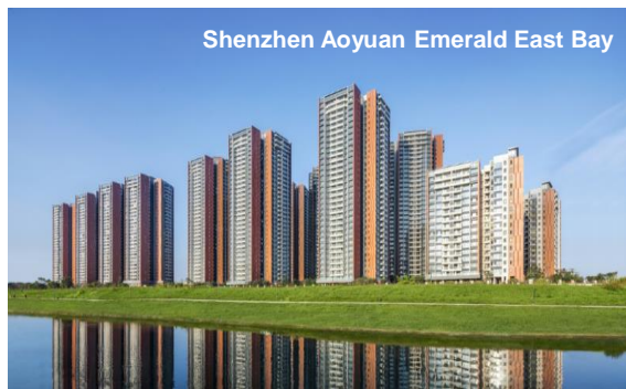
Shenzhen Aoyuan Emerald East Bay

The Kinpan Awards is an authoritative and professional award in the PRC real estate industry and real estate design industry. With "innovation, quality, living environment and value" as judging criteria, it assesses projects on a range of metrics including positioning, innovation, construction quality, experience, layout design, floor area use, health and smart system, safety and comfort, cultural and humanity attributes, as well as investment value. Aoyuan's achievements at this year's Kinpan Awards fully reflected the industry recognition for its 5A+ products.