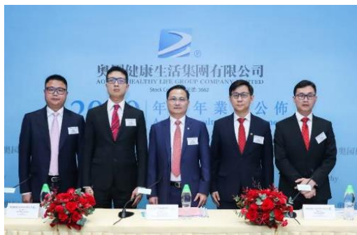
Guangzhou Main Venue

On 30 March, Aoyuan Healthy Life announced its annual results for the year ended 31 December 2020. Total revenue was RMB1.41 billion, up 56.3% y-o-y. Gross profit was RMB481 million, up 42.8% y-o-y. Net profit was RMB253 million, up 55.1% y-o-y. Net profit margin was about 18%. Earnings per share was RMB34.48 cents per share, up 45% y-o-y. The Board of Directors recommended a final dividend per share of RMB14 cents, up 55.6% y-o-y.