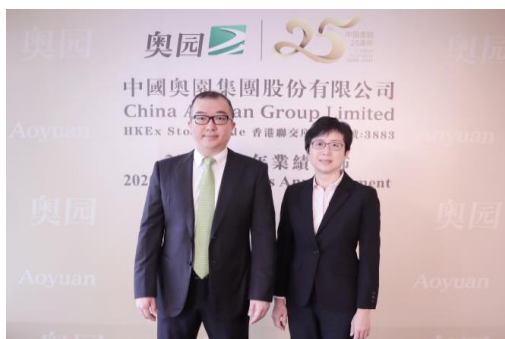
Hong Kong Sub-venue