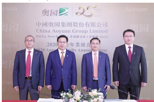
Guangzhou Main Venue

During the year, revenue increased by 34% y-o-y to RMB67.8 billion; net profit increased by 35% y-o-y to RMB7.1 billion; net profit attributable to shareholders increased by 41% y-o-y to RMB5.9 billion. Earnings per share increased by 40% y-o-y to RMB218.8 cents per share. During the year, urban redevelopment achieved satisfactory profit from primary development. In addition, with 2021 marking the 25th anniversary of Aoyuan, the Board of Directors recommended a final dividend per share of RMB66 cents and a special dividend per share of RMB11 cents, making up a total dividend per share of RMB77 cents, up 40% year-on-year, maintaining a stable and generous dividend policy.