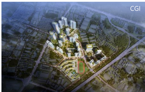
Shenzhen Longgang Dapu Project

Aoyuan has achieved full coverage of "Three Olds" urban redevelopment, namely old towns, old villages and old factories. As of end-December 2020, it had 60 urban redevelopment projects at different phases with planned total saleable resources of approx. RMB673 billion, of which RMB655.2 billion are located in Greater Bay Area, accounting for 97%.