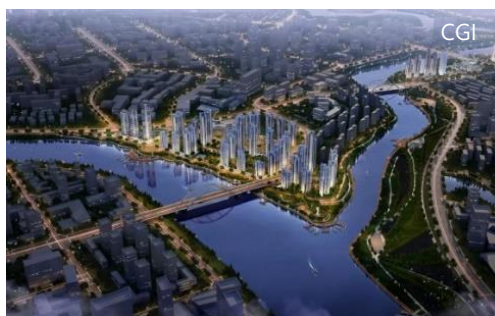
Nanning Yongning Project