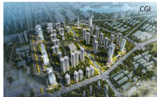
Foshan Chancheng Shen Village Project