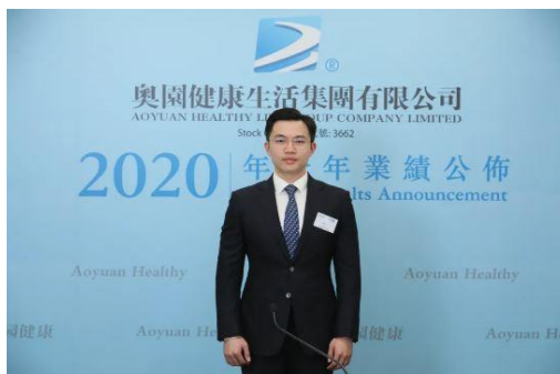
Hong Kong Sub-venue